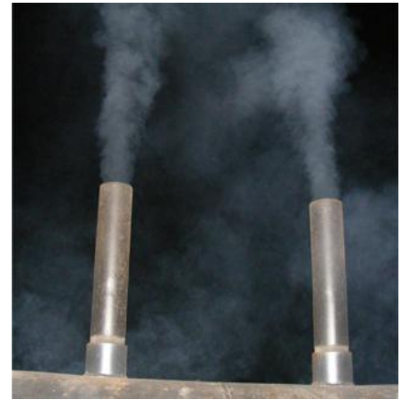
Cooking all night