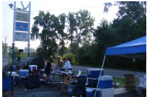
Preparing the Meat for LST Plate Lunches