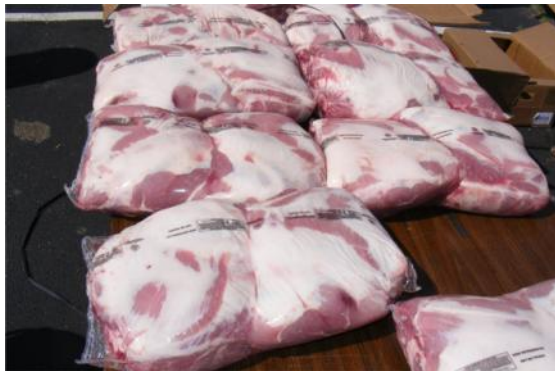
The Guest of Honor