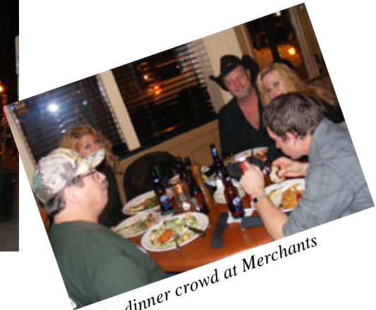
The dinner crowd at Merchants