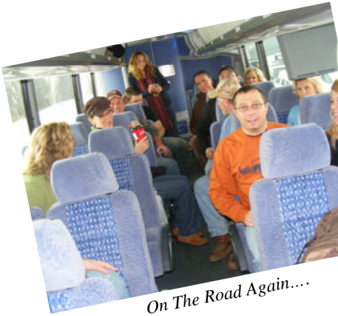
On The Road Again....