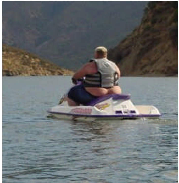
Two good reasons for extra-long life jackets.

If you plan on insuring your boat you can learn about BoatUS policy options and terms, its one-of-a-kind damage avoidance program or get a free online quote at BoatUS.com/insurance .