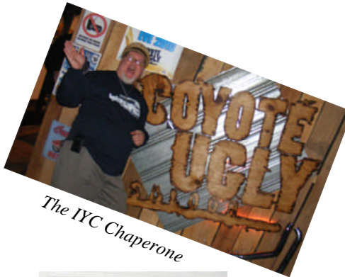
The IYC Chaperone