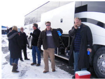
It was a bright and snowy day