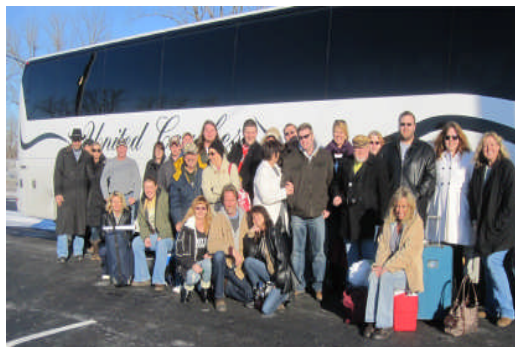
The Gang upon returning to Inland

The trip down to Nashville was the most enjoyable, uncompromising, unstressful time we’ve ever had. There were a few raffles of some very decent